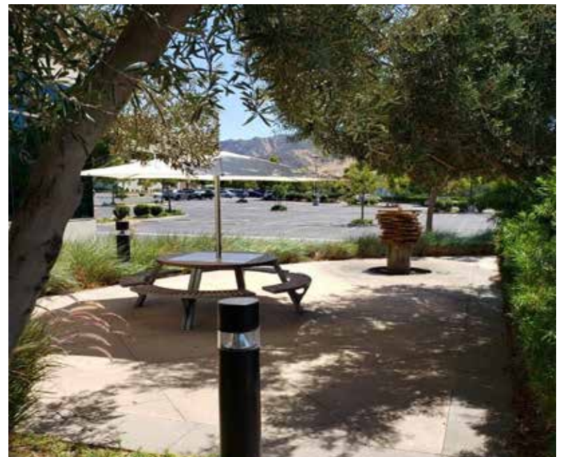
Outdoor seating areas