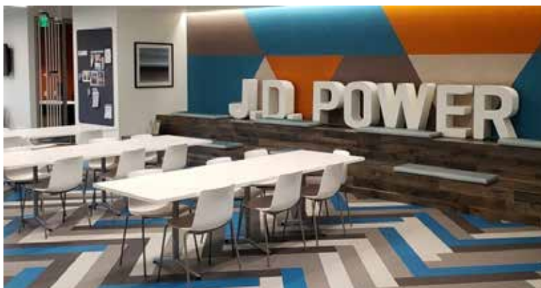
Modern, updated feel