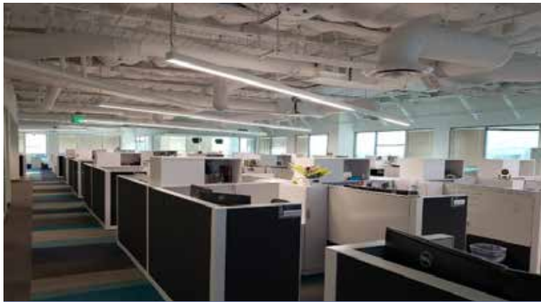
Creative office space