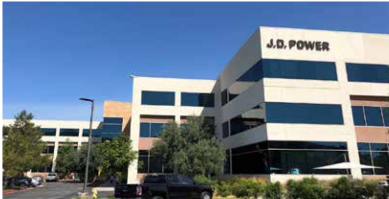
Exterior with prominent signage